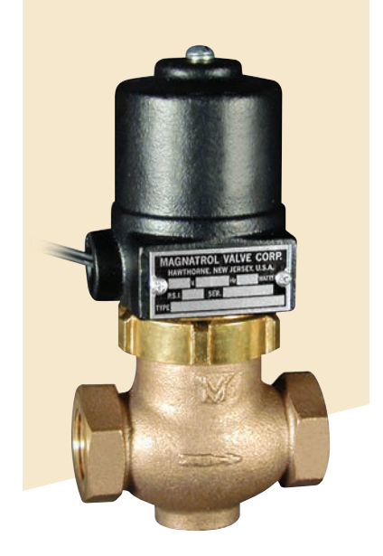
For Options and Accessories see pages 26 & 27. Strainers are recommended for use with solenoid valves (see page 19).

MAX. FLUID TEMP. 212° F MAX. STATIC PRESSURE 300 PSI